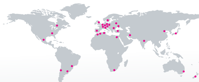
Global presence Several hundred customers around the world use Laempe's LL-series automatic core shooters to produce top-quality cores.

LET US CREATE A TAILORED PACKAGE TO MEET YOUR SPECIAL REQUIREMENTS!